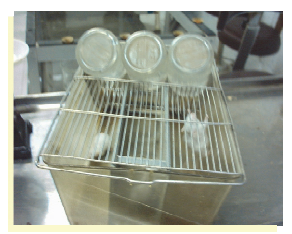
Figure 1. Mice kept in separate cages

weight of female mice was evaluated. The mice were kept in separate cages (Figure 1) in a room where temperature and humidity were held constant (with a 12/12-hour light-dark cycle).