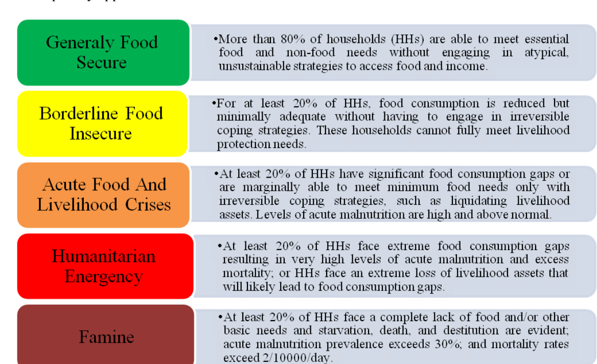
Figure 1. Integrated Food Security Phase Classification