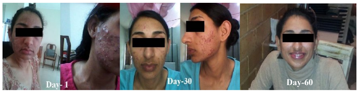
Figure 1-3. Changes in lesions across 60 days

Our patient showed marked improvement in her symptoms during the course of the treatment. The entire intervention was given for 30 days. There was considerable reduction in the eruptions and inflammation on her face. During 3rd day of fasting, 3- 4 new eruptions appeared which gradually disappeared during the course of fasting. At the end of her stay her skin was much clearer and there was no inflammation or swelling. The sequential changes are demonstrated in figure 1, 2 and 3 respectively. The patient does not express any sort of discomfort during the entire course of treatment. The entire timeline of this case is depicted in Figure 4.The patient was followed up for a month post intervention, but no relapse of symptoms was reported.